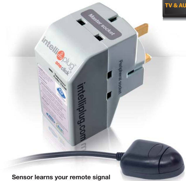
Sensor learns your remote signal

The TVA105 IntelliPlug learns to recognise the signal from your television remote control which enables it to activate your television automatically into standby mode whenever you are ready to use it. When you have finished using your television you switch it off in the normal way using your remote control and the IntelliPlug does the rest!